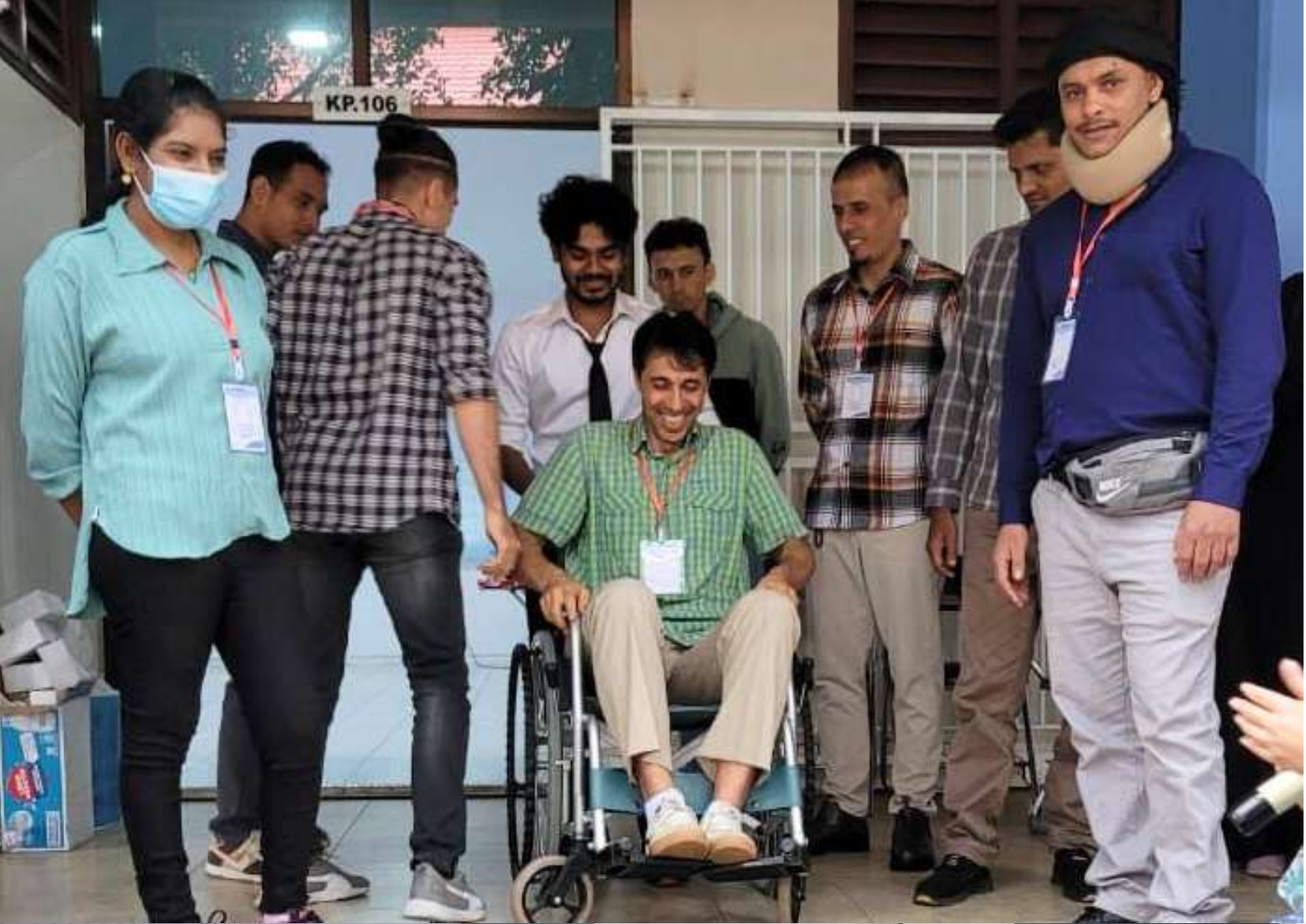
Makassar, 16-28 July 2023