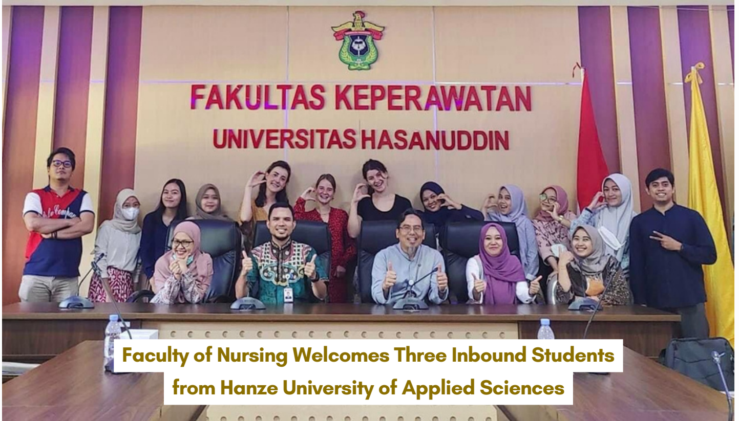
Faculty of Nursing Welcomes Three Inbound Students from Hanze University of Applied Sciences

The Faculty of Nursing, Hasanuddin University (FKEP-UNHAS) welcomed two Nursing students and one Physiotherapy student for the Student Exchange program from Hanze University of Applied Sciences, Groningen, the Netherlands. This Student Exchange is one form of cooperation between UNHAS and Hanze University of Applied Sciences, Groningen, Netherlands, in addition to the teacher exchange and research programs since 2017. The three inbound students will stay for an internship in a public health centre for three months.